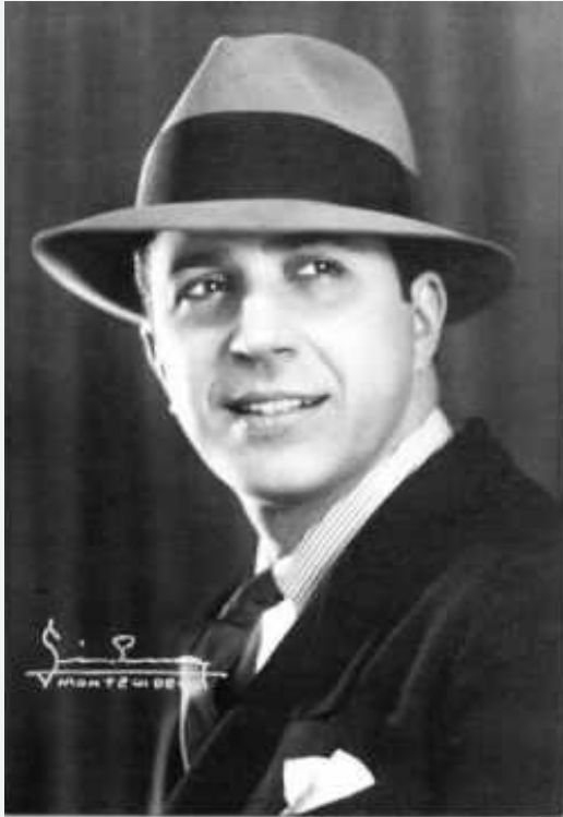
Carlos Gardel (tango)