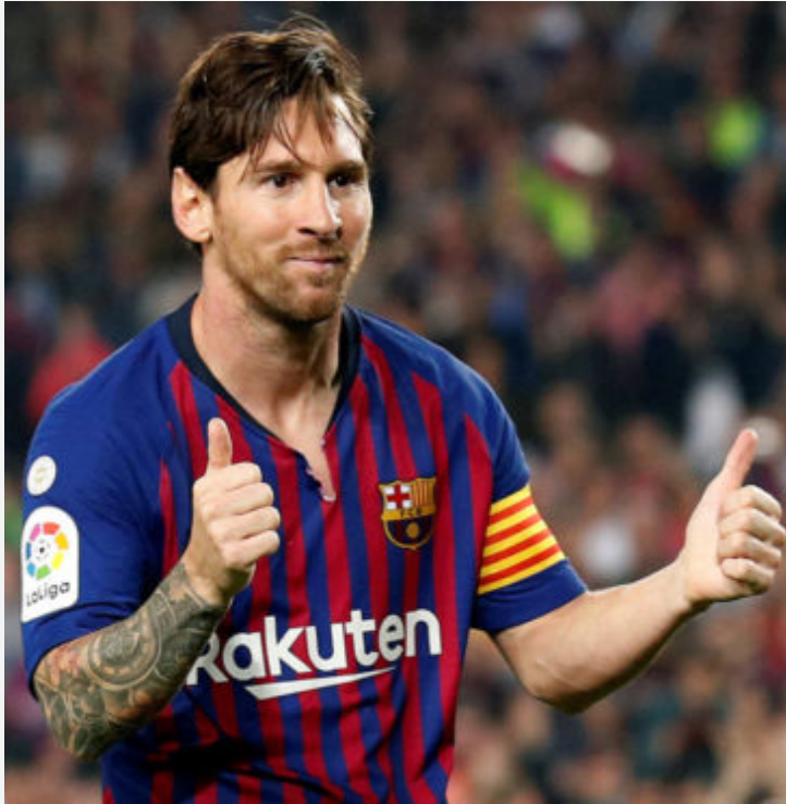
Lionel Messi (football)