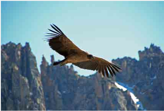
Cóndor de los Andes