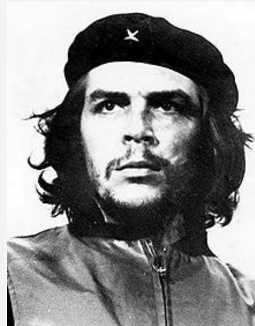
Che Guevara (politics)