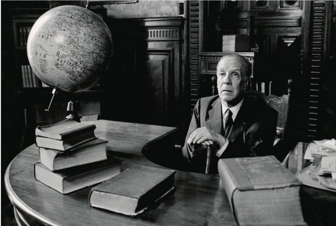
Jorge Luis Borges (literature)