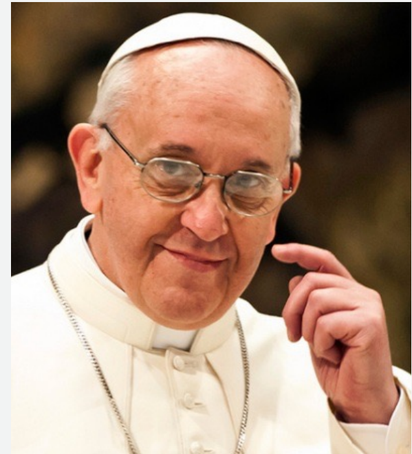
Pope Francis (religion)