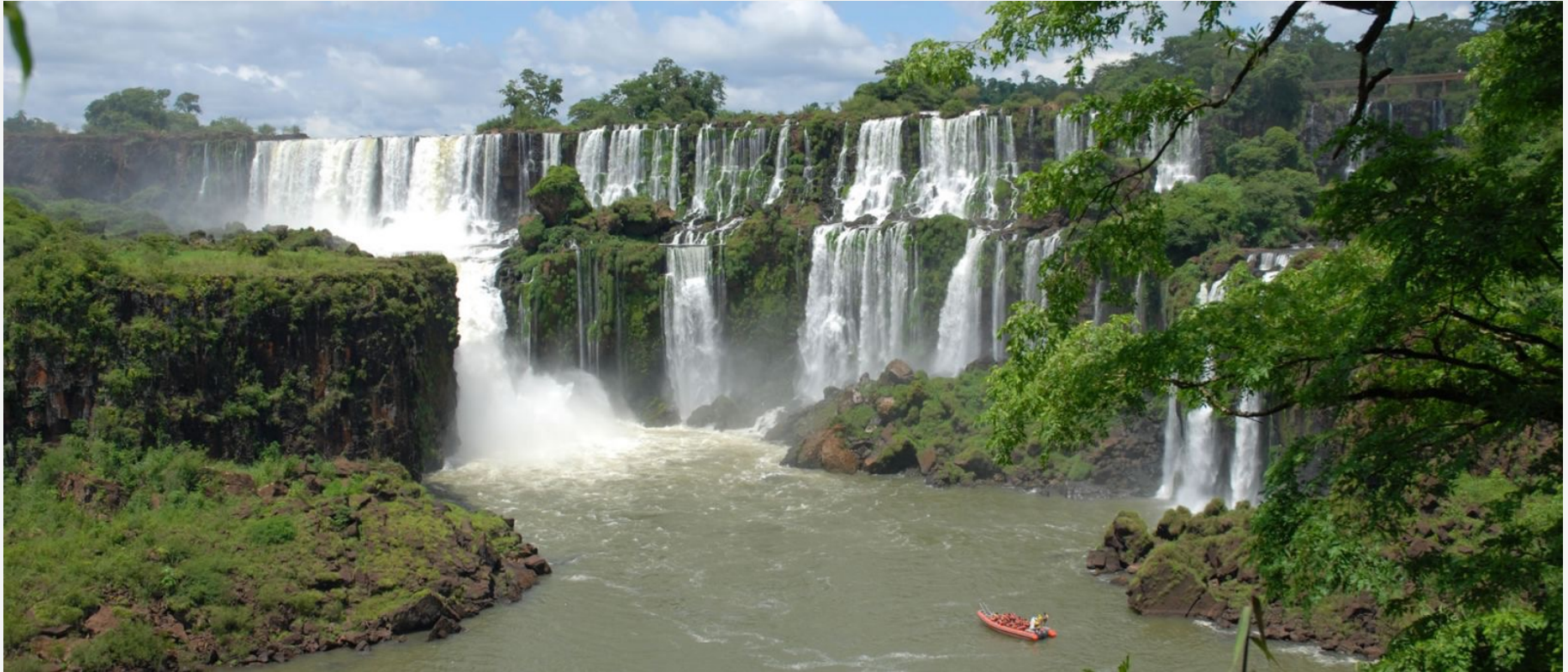
Iguazú national park