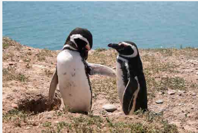
Penguins in Magallanes (south)