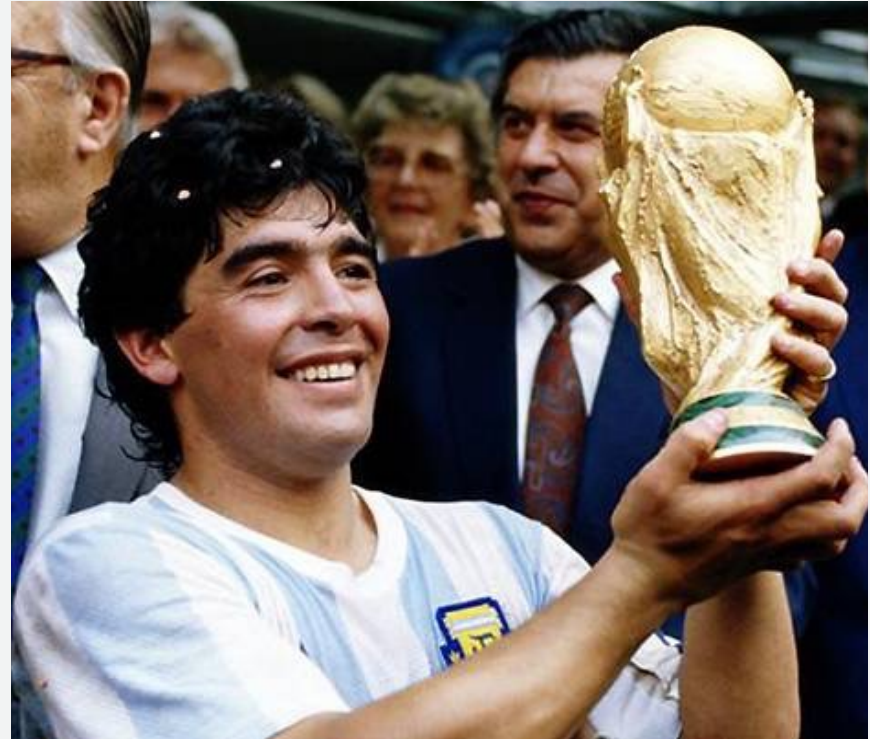
Diego Maradona (football)